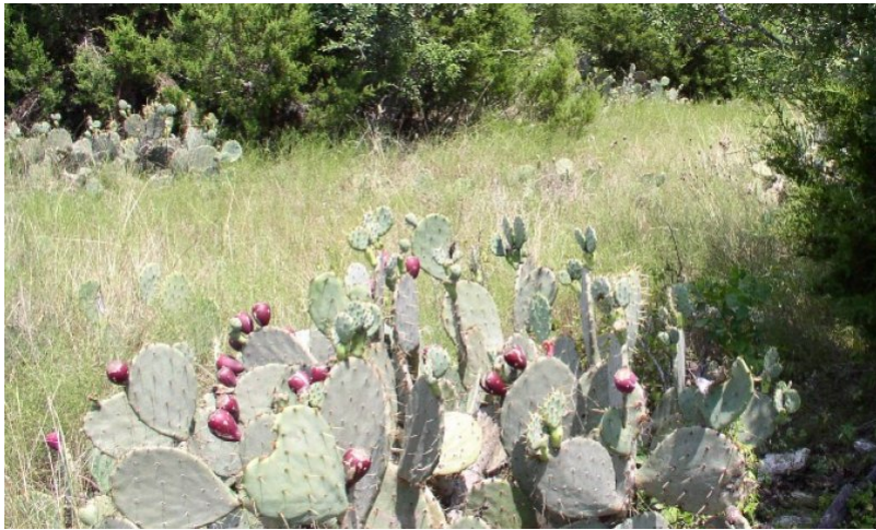
Figure 15. 2.1 Woodland Community

This plant community is a Woodland Community (2.1) having greater than 20% woody canopy dominated by Ashe juniper, redberry juniper ( Juniperus pinchotti ), prickly pear ( Opuntia spp.) and honey mesquite ( Prosopis glandulosa ). Other species present in small amounts are hackberry, Texas oak and live oak. The herbaceous understory is almost nonexistent. Shade tolerant species such as Texas wintergrass and cedar sedge ( Carex planostachys ) tends to dominate the site where mesquite is the major woody plant. When the canopy of juniper increases toward a cedar breaks community most grasses have almost disappeared. Due to the presence of shade, the amount of total grass cover is greatly reduced which in turn reduces herbaceous production. Continuous heavy grazing by domestic livestock has accelerated the shift. The tallgrass prairie can be restored by prescribed burning but will require many years of burning and prudent grazing management due to low production of fine fuel and the absence of a seed source for the tall grasses. Chemical control alone is a choice for treatment on a large scale especially where a seed source is present. Mechanical treatment of this site along with range planting is a good option when seeding is needed.