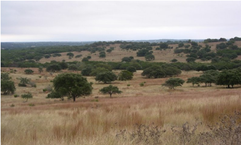
Figure 9. 1.1 Tallgrass Prairie Community