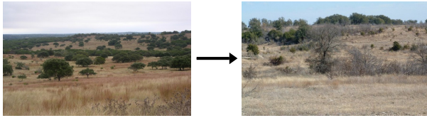
Tallgrass Prairie Community