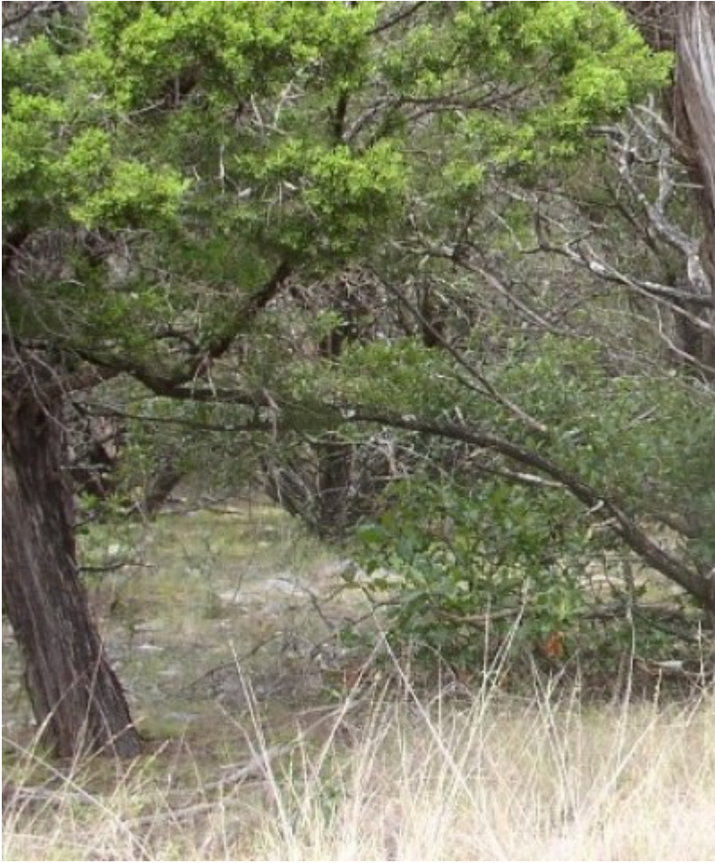
Figure 20. 3.2 Woodland Community

The Open Grassland Community (3.1) which is established to native and or introduced grasses can also become invaded with woody species without fire and/or brush management to suppress their spread. Thus the Woodland Community (3.2) becomes established with Ashe juniper, redberry juniper, pricklypear, honey mesquite and other woody shrubs or trees since the oaks and other higher successional plants have been virtually eliminated. The seeded state (3.1) with prescribed burning and prescribed grazing could not revert back to the tallgrass prairie state within any reasonable time because of the loss of original plants and the invasive nature of the introduced plants.