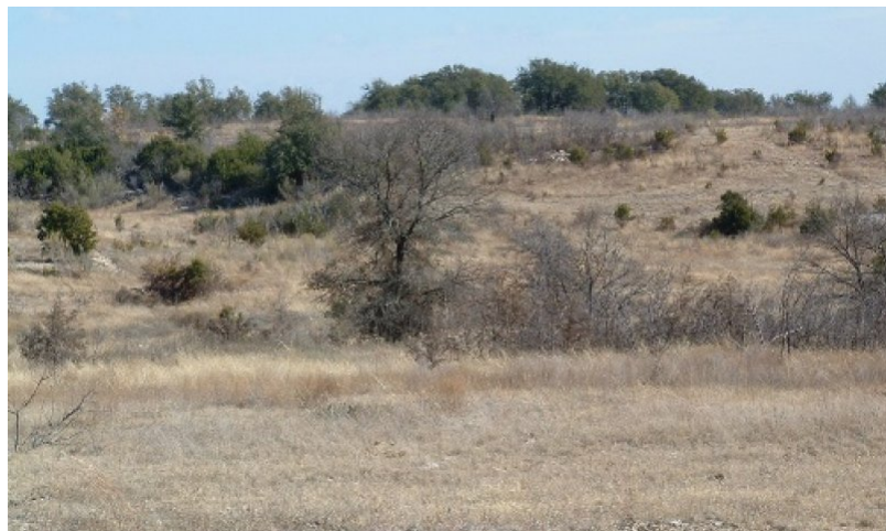
Figure 12. 1.2 Mid/Tallgrass Community