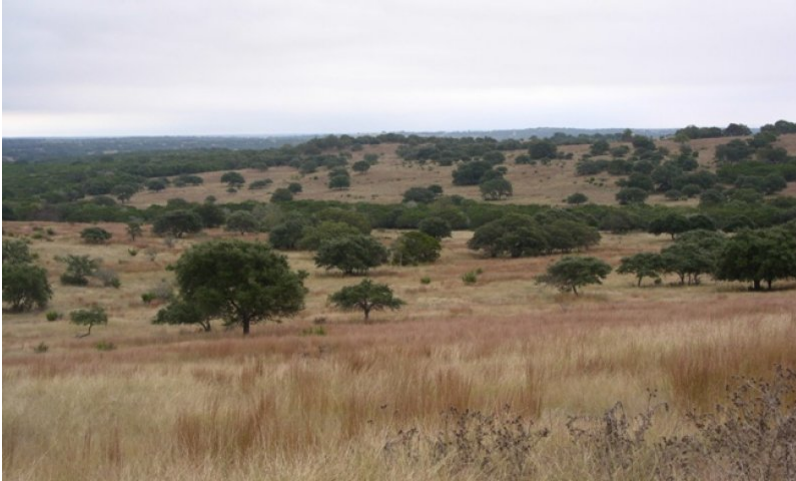
Figure 9. 1.1 Tallgrass Prairie Community