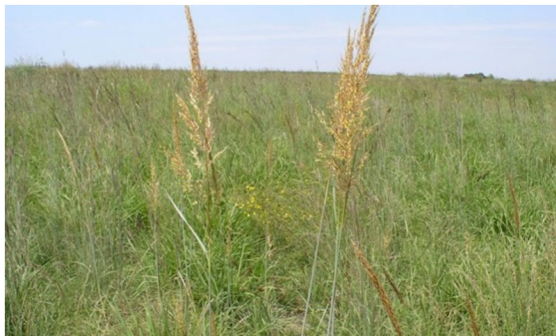
Figure 9. 1.1 Tallgrass Prairie Community