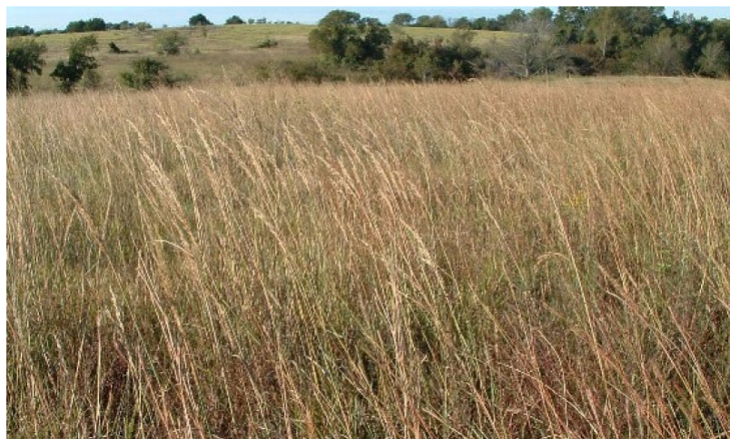
Figure 12. 1.2 Tall and Midgrass Prairie Community

This transition state occurs without fire or brush management with heavy yearlong grazing. The tall grasses will start to disappear from the plant community and are replaced by midgrasses such as sideoats grama, which will increase. Invader brush species such as Ashe juniper appears and becomes established. Greenbriar ( Smilax bonanox ), cedar elm ( Ulmus crassifolia ), bumelia ( Sideroxylon lanuginosum ), and hackberry ( Celtis spp.) also start to increase. Texas wintergrass increases as brush canopy increases. The plant community consists of less than 10 percent canopy of woody plants. Continuous grazing by domestic livestock and fire suppression has accelerated the shift towards the Shrubland Community (3.1). The Tall and Midgrass Community (1.2) can revert back to the Tallgrass Prairie Community (1) with the implementation of prescribed burning and/or prescribed grazing management practices. Without prescribed burning and/or prescribed grazing, this plant community would continue to shift toward the Short and Midgrass Community (2.1) or Shrubland Community (3.1). The Tall/Midgrass Community (1.2) can be converted to the Converted Land State consisting of Cropland, Pastureland or Native Seeding communities. The Converted Land State with many years of executing the prescribed burning and prescribed grazing practices could revert back to the Tall/Midgrass Community. The gilgai will return after 20 or more years if the plant community is not plowed.