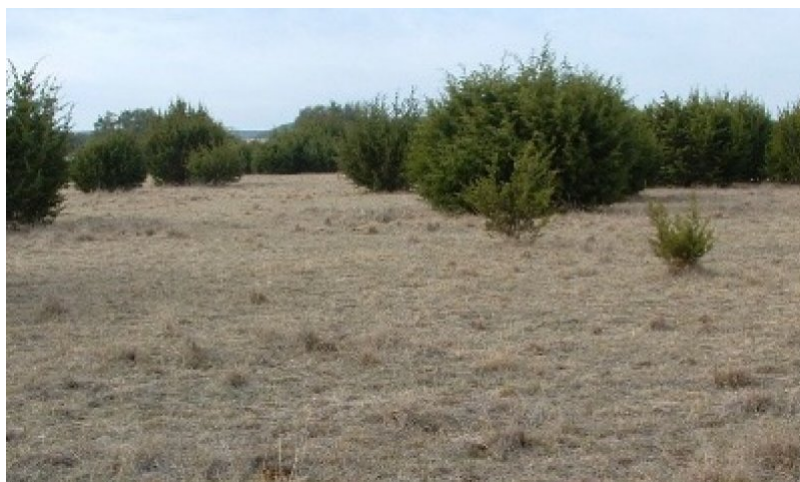
Figure 15. 2.1 Short and Midgrass Community