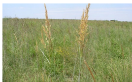
Tallgrass Prairie Community

With the implementation of conservation practices such as Prescribed Grazing, Brush Management, and Prescribed Burning, the Tall and Midgrass Prairie Community can be restored to the Tallgrass Prairie Community.