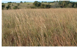
Tall and Midgrass Prairie Community