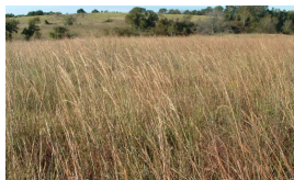
Tall and Midgrass Prairie Community

With heavy continuous grazing, no brush management, and no fire, the Tallgrass Prairie Community transitions to the Tall and Midgrass Prairie Community.