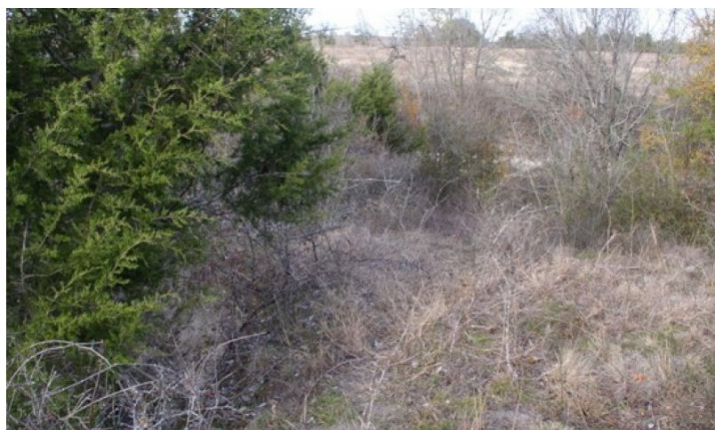
Figure 18. 3.1 Shrubland Community