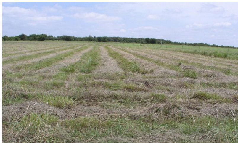
Figure 21. 4.1 Pastureland Community