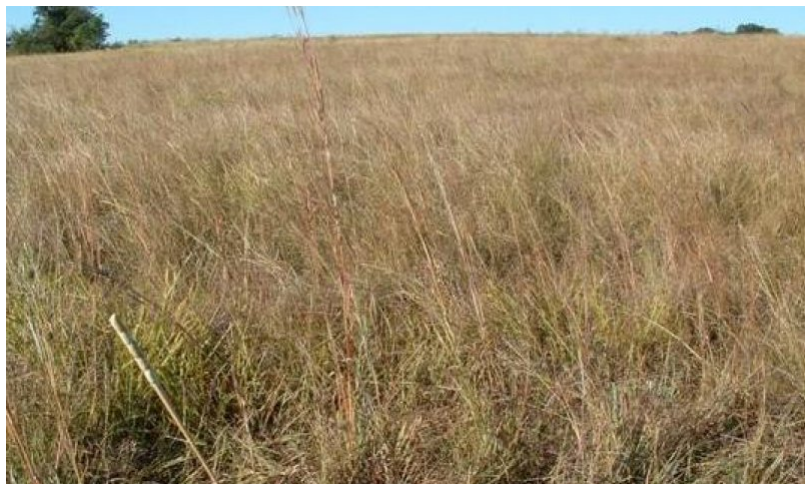
Figure 9. 1.1 Tallgrass Prairie Community

The interpretive plant community for this site is the reference plant community(1.1). The community is dominated by warm-season perennial tallgrasses such as little bluestem, big bluestem, eastern gamagrass and Indiangrass. Other major perennial grass species such as switchgrass, sideoats grama and silver bluestem are well dispersed through the site. Perennial forbs such as sunflowers ( Simsia spp.), prairie clovers ( Dalea spp.), bundleflowers ( Desmanthus spp.), and daleas ( Daleas spp.) are well represented throughout the community. This plant community evolved with a short duration of heavy use by large herbivores followed by long rest periods due to herd migration along with occasional fire. This state can go directly to the Shrubland Community (3.1), in the absence of fire or brush management to assist in suppressing the brush species, and still have the tallgrass component present in the community. With heavy grazing pressure and the subsequent removal of fire, the historic community will change into a Tall and Midgrass Prairie Community (1.2), a Short and Midgrass Prairie Community (2.1) or Shrubland Community (3.1). The changes within the grassland communities can change fairly rapid while the communities having an increase of woody plants are somewhat slower.