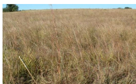
Tallgrass Prairie Community

With the application of Prescribed Grazing, Brush Management, and Prescribed Burning conservation practices, the tall/midgrass prairie community can be reverted back to the tallgrass prairie community.