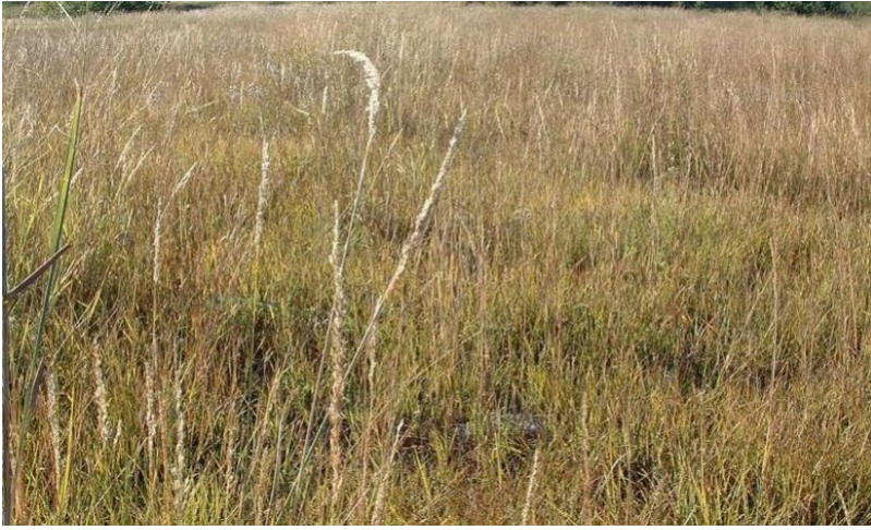
Figure 12. 1.2 Tall and Midgrass Prairie Community

This transitional community occurs with heavy yearlong grazing by large herbivores without the application of fire or brush management practices. The tallgrasses will start to disappear from the plant community. Brush not native to this site (mesquite, juniper, and pricklypear cactus, etc.) appear and become readily established. Cedar elm ( Ulmus crassifolia ), bumelia, and hackberry also start to increase in density and stature. Texas wintergrass ( Nassella leucotricha ) increases as brush canopy increases. It is more shade tolerant since most of growth occurs during the cool season when brush has lost its leaves. This plant community consists of less than 10 percent canopy of woody plants. Continuous heavy grazing by domestic livestock has accelerated the shift towards the Shrubland State (3.1). The tall and midgrass prairie community (1.2) can revert back to the Tallgrass Prairie Community (1.1) with conservation practices such as brush management, prescribed burning and/or prescribed grazing. Without prescribed burning and/or prescribed grazing, this plant community would continue to shift toward the Short and Midgrass Community (2.1) or Shrubland Community (3.1).