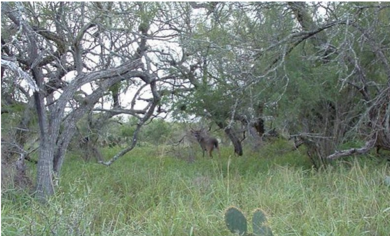
Figure 18. 3.1 Shrubland Community

This plant community is a Shrubland Community (3.1) having greater than 20% woody canopy dominated by mesquite and or juniper. Other species present in small amounts are cedar elm, hackberry, and live oak. The herbaceous understory is almost nonexistent. Shade tolerant species such as Texas wintergrass tends to dominate the site where mesquite is the major woody plant. When the canopy of Juniper increases toward a cedar breaks type community most grasses have disappeared. Continuous grazing by domestic livestock has accelerated the shift. The tallgrass prairie can be restored by prescribed burning and prescribed grazing but will require many years of burning due to light fuel load of fine fuel and the absence of a seed source for the tall grasses. Chemical control alone is usually a good option for treatment on a large scale especially where a seed source is present. Mechanical treatment of this site along with seeding is a good when seeding is needed. Due to the presence of shade, the amount of grass cover is greatly reduced which in turn reduces forage production from the historic state.