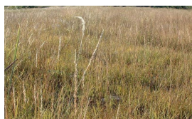
Tall and Midgrass Prairie Community