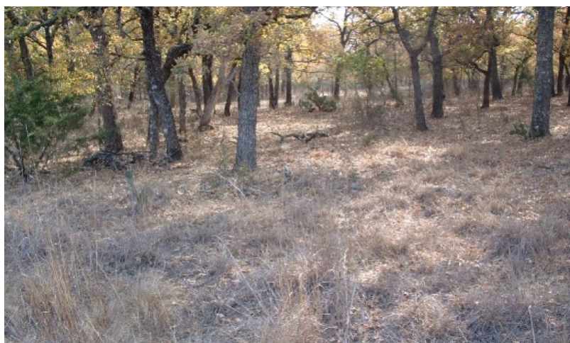
Figure 14. 2.1 Oak/Juniper/Midgrass Community

The Oak/Juniper/Midgrass Community (2.1) consists of mid grasses with 10 to 20 percent canopies of woody plants. As the plant community ages, brush canopy continues to increase and midgrasses such as sideoats grama decreases and Texas wintergrass and buffalograss ( Buchloe dactyloides ) increase. Without fire, Ashe juniper becomes the dominant invader plant while mesquite appears and becomes established. Warm-season perennial tall grasses such as Indiangrass and switchgrass have all but disappeared. Continuous grazing by domestic livestock has accelerated the shift. The shift to this state has occurred due to the absence of fire or other means of brush suppression coupled with heavy grazing by domestic livestock. The grass species are increasingly annual cool-season species. This state can still be reverted back to near historic condition by some means of brush suppression and good grazing management. Without these treatments, the site will continue to shift toward more dense stands of brush and become the Oak/Juniper/Mesquite Complex (3.1) state.