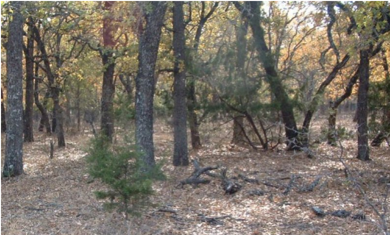
Figure 17. 3.1 Oak/Juniper/Mesquite Complex

This plant community is an Oak/ Juniper/ Mesquite Complex (3.1) having greater than 20% woody canopy dominated by Ashe juniper and honey mesquite. Other species present in small amounts are cedar elm, hackberry, and live oak ( Quercus virginiana ). The herbaceous understory is almost nonexistent. Shade tolerant species such as Texas wintergrass tends to dominate the site where mesquite is the major woody plant. When the juniper canopy increases toward a cedar breaks type community, grasses have almost disappeared. Continuous grazing by domestic livestock has accelerated the shift. The reference community can be restored by prescribed burning and grazing but will require many years of burning currently due to the light fuel load of fine fuel and the absence of a seed source for the tall grasses. In general, the uses of fire on mature (larger) or a dense stand of woody plants does not have the same positive effects as burning in tallgrass communities. Chemical control alone is usually a good option for treatment on a large scale especially where a seed source is present. Mechanical treatment of this site along with range planting is a good option when seeding is necessary. After brush has been controlled mechanically or with herbicides, fire can then be used to suppress re-growth. Fuel loads are often the most limiting factor for the effective use of prescribed fire on this site. Due to the presence of shade, the amount of grass cover is