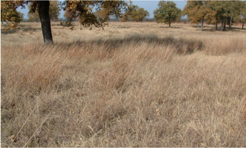
Figure 11. 1.2 Tall and Midgrass/Oak Savannah Community