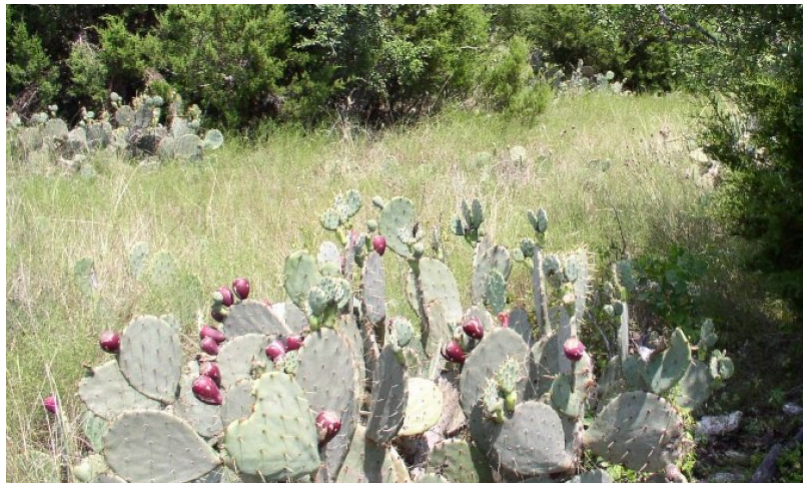
Figure 15. 2.1 Woodland Community

This plant community is a Woodland Community (2.1) having greater than 20% woody canopy dominated by Ashe juniper, redberry juniper ( Juniperus pinchotti ), prickly pear ( Opuntia spp.) and honey mesquite ( Prosopis glandulosa ). Other species present in small amounts are hackberry, Texas oak and live oak. The herbaceous understory is almost nonexistent. Shade tolerant species such as Texas wintergrass and cedar sedge ( Carex planostachys ) tends to dominate the site where mesquite is the major woody plant. When the canopy of juniper increases toward a cedar breaks community most grasses have almost disappeared. Due to the presence of shade, the amount of total grass cover is greatly reduced which in turn reduces herbaceous production. Continuous heavy grazing by domestic livestock has accelerated the shift. The tallgrass prairie can be restored by prescribed burning but will require many years of burning and prudent grazing management due to low production of fine fuel and the absence of a seed source for the tall grasses. Chemical control alone is a choice for treatment on a large scale especially where a seed source is present. Mechanical treatment of this site along with range planting is a good option when seeding is needed.