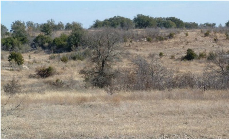
Figure 12. 1.2 Mid/Tallgrass Community