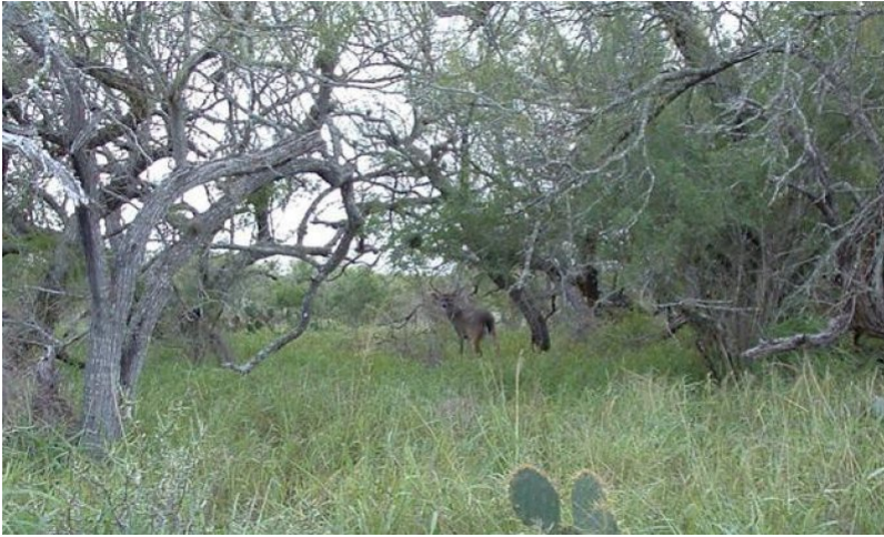
Figure 18. 3.1 Shrubland Community

This plant community is a Shrubland Community (3.1) having greater than 20% woody canopy dominated by mesquite and or juniper. Other species present in small amounts are cedar elm, hackberry, and live oak. The herbaceous understory is almost nonexistent. Shade tolerant species such as Texas wintergrass tends to dominate the site where mesquite is the major woody plant. When the canopy of Juniper increases toward a cedar breaks type community most grasses have disappeared. Continuous grazing by domestic livestock has accelerated the shift. The tallgrass prairie can be restored by prescribed burning and prescribed grazing but will require many years of burning due to light fuel load of fine fuel and the absence of a seed source for the tall grasses. Chemical control alone is usually a good option for treatment on a large scale especially where a seed source is present. Mechanical treatment of this site along with seeding is a good when seeding is needed. Due to the presence of shade, the amount of grass cover is greatly reduced which in turn reduces forage production from the historic state.