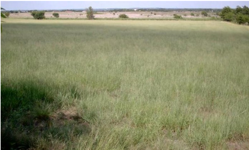
Figure 23. 4.2 Pastureland Community