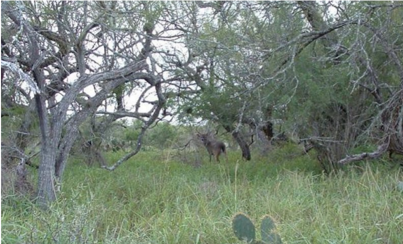
Figure 18. 3.1 Shrubland Community

This plant community is a Shrubland Community (3.1) having greater than 20% woody canopy dominated by mesquite and or juniper. Other species present in small amounts are cedar elm, hackberry, and live oak. The herbaceous understory is almost nonexistent. Shade tolerant species such as Texas wintergrass tends to dominate the site where mesquite is the major woody plant. When the canopy of Juniper increases toward a cedar breaks type community most grasses have disappeared. Continuous grazing by domestic livestock has accelerated the shift. The tallgrass prairie can be restored by prescribed burning and prescribed grazing but will require many years of burning due to light fuel load of fine fuel and the absence of a seed source for the tall grasses. Chemical control alone is usually a good option for treatment on a large scale especially where a seed source is present. Mechanical treatment of this site along with seeding is a good when seeding is needed. Due to the presence of shade, the amount of grass cover is greatly reduced which in turn reduces forage production from the historic state.