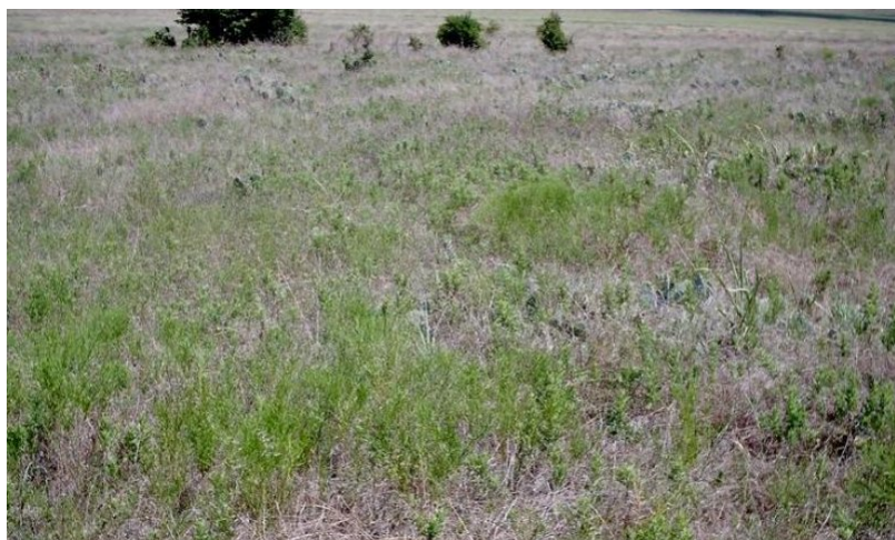
Figure 15. 2.1 Short & Midgrass Prairie Community

The Short and Midgrass Prairie Community (2.1) consists of short and mid grasses with 5 to 15 percent canopy of woody plants. As this community matures, brush canopy along with grasses such as Texas wintergrass, threeawns ( Aristida spp.) and annuals continues to increase. Warm-season perennial tallgrasses such as Indiangrass and switchgrass have all but disappeared. Continuous overgrazing by domestic livestock has accelerated the shift. The shift to this state has occurred due to the absence of fire or other means of brush suppression coupled with heavy grazing by domestic livestock. The grass species that dominate the site are mostly annual cool-season species. This state can be reverted back to near reference condition by some means of brush suppression and grazing management. Without this treatment the site will continue to shift toward more dense stands of brush. This change can be anywhere from as little as one year to ten or more depending on the grass species present and degree of grazing management.