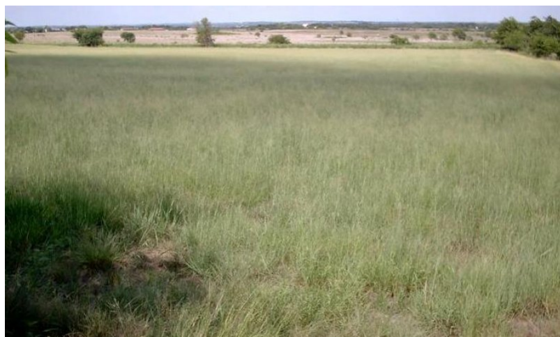
Figure 23. 4.2 Pastureland Community