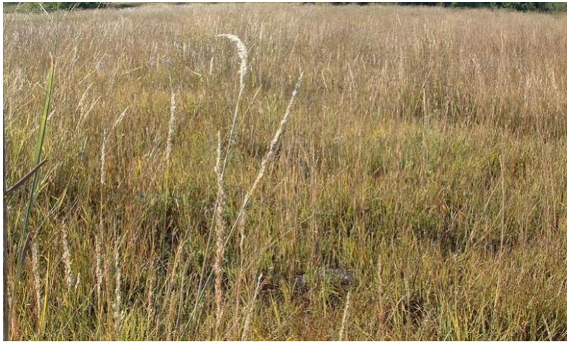
Figure 12. 1.2 Tall and Midgrass Prairie Community

This transitional community occurs with heavy yearlong grazing by large herbivores without the application of fire or brush management practices. The tallgrasses will start to disappear from the plant community. Brush not native to this site (mesquite, juniper, and pricklypear cactus, etc.) appear and become readily established. Cedar elm ( Ulmus crassifolia ), bumelia, and hackberry also start to increase in density and stature. Texas wintergrass ( Nassella leucotricha ) increases as brush canopy increases. It is more shade tolerant since most of growth occurs during the cool season when brush has lost its leaves. This plant community consists of less than 10 percent canopy of woody plants. Continuous heavy grazing by domestic livestock has accelerated the shift towards the Shrubland State (3.1). The tall and midgrass prairie community (1.2) can revert back to the Tallgrass Prairie Community (1.1) with conservation practices such as brush management, prescribed burning and/or prescribed grazing. Without prescribed burning and/or prescribed grazing, this plant community would continue to shift toward the Short and Midgrass Community (2.1) or Shrubland Community (3.1).