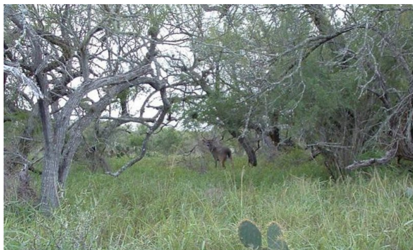
Figure 18. 3.1 Shrubland Community

This plant community is a Shrubland Community (3.1) having greater than 20% woody canopy dominated by mesquite and or juniper. Other species present in small amounts are cedar elm, hackberry, and live oak. The herbaceous understory is almost nonexistent. Shade tolerant species such as Texas wintergrass tends to dominate the site where mesquite is the major woody plant. When the canopy of Juniper increases toward a cedar breaks type community most grasses have disappeared. Continuous grazing by domestic livestock has accelerated the shift. The tallgrass prairie can be restored by prescribed burning and prescribed grazing but will require many years of burning due to light fuel load of fine fuel and the absence of a seed source for the tall grasses. Chemical control alone is usually a good option for treatment on a large scale especially where a seed source is present. Mechanical treatment of this site along with seeding is a good when seeding is needed. Due to the presence of shade, the amount of grass cover is greatly reduced which in turn reduces forage production from the historic state.