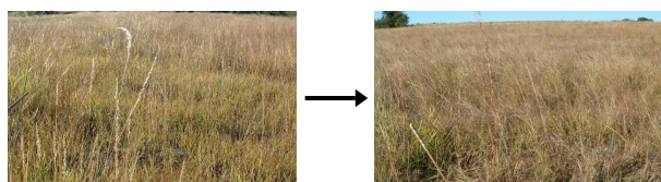
Tall and Midgrass Prairie Community