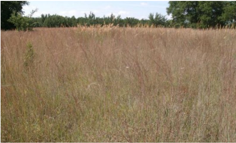
Figure 9. 1.1 Oak Savannah/Tallgrass Community