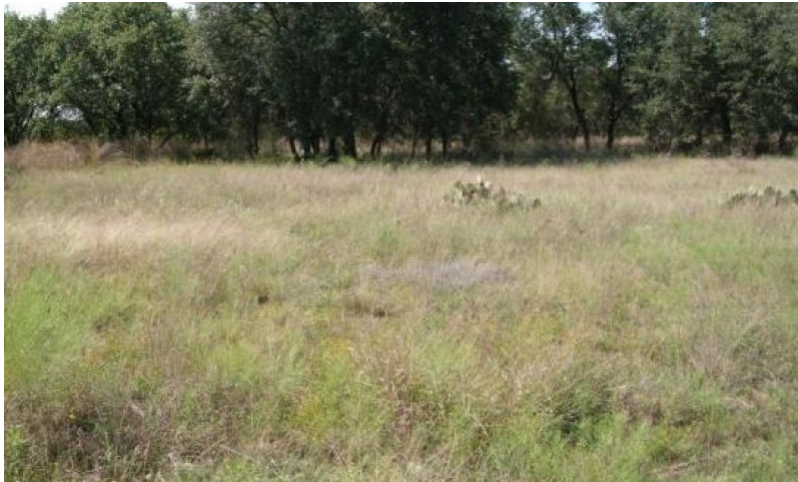
Figure 12. 1.2 Oak Savannah/Midgrass Community