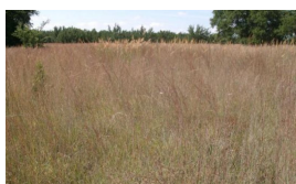
Oak Savannah/Tallgrass Community