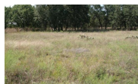
Oak Savannah/Midgrass Community