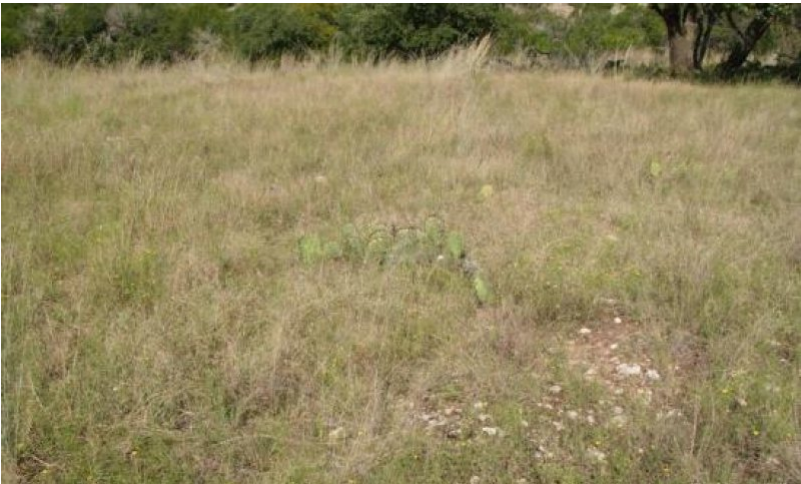
Figure 15. 2.1 Mixed-Brush/Shortgrass Community