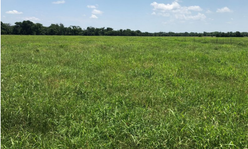
Figure 10. Burlseson soils. Carter County, OK

This state represents a change in land use from rangeland to pastureland. The soil structure and biology has been altered and the site is dominated by introduced species. Management of introduced forages requires more inputs than native grasses. Careful consideration should be taken prior to planting to ensure the result meets the desired use. Ratings for forage yields can be found under the non-irrigated crop yield section in web soil survey. As with any fertility management program, current soil tests should be taken before planting and subsequent fertilization of introduced pastures. The most common forage species on these sites include Bermudagrass and Old World Bluestems(eg. KR Bluestem). Without brush management, woody species such as mesquites, junipers, elms, or honey locust may invade these sites. There may be opportunities to plant native grass species on these sites to restore the reference plant communities. The success of this type of restoration is highly variable and depends on the remaining soil resources and past management. This type of endeavor often requires site specific planning and evaluation. However, the species described in the reference state are a good resource for initial planning of any restoration project.