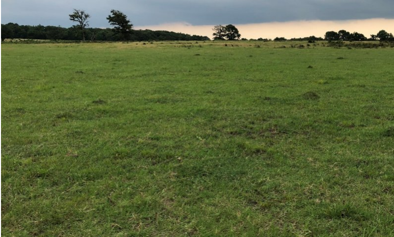
Figure 10. Agan soils. Johnston County, OK

This state represents a change in land use from rangeland to pastureland. The soil structure and biology has been altered and the site is dominated by introduced species. Management of introduced forages requires more inputs than native grasses. Careful consideration should be taken prior to planting to ensure the result meets the desired use. Ratings for forage yields can be found under the non-irrigated crop yield section in web soil survey. As with any fertility management program, current soil tests should be taken before planting and subsequent fertilization of introduced pastures. The most common forage species on these sites include Bermudagrass and Old World Bluestems(eg. KR Bluestem). Without brush management, woody species such as mesquites, junipers, elms, or honey locust may invade these sites. There may be opportunities to plant native grass species on these sites to restore the reference plant communities. The success of this type of restoration is highly variable and depends on the remaining soil resources and past management. This type of endeavor often requires site specific planning and evaluation. However, the species described in the reference state are a good resource for initial planning of any restoration project.