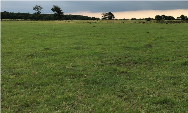
Figure 10. Agan soils. Johnston County, OK

This state represents a change in land use from rangeland to pastureland. The soil structure and biology has been altered and the site is dominated by introduced species. Management of introduced forages requires more inputs than native grasses. Careful consideration should be taken prior to planting to ensure the result meets the desired use. Ratings for forage yields can be found under the non-irrigated crop yield section in web soil survey. As with any fertility management program, current soil tests should be taken before planting and subsequent fertilization of introduced pastures. The most common forage species on these sites include Bermudagrass and Old World Bluestems(eg. KR Bluestem). Without brush management, woody species such as mesquites, junipers, elms, or honey locust may invade these sites. There may be opportunities to plant native grass species on these sites to restore the reference plant communities. The success of this type of restoration is highly variable and depends on the remaining soil resources and past management. This type of endeavor often requires site specific planning and evaluation. However, the species described in the reference state are a good resource for initial planning of any restoration project.