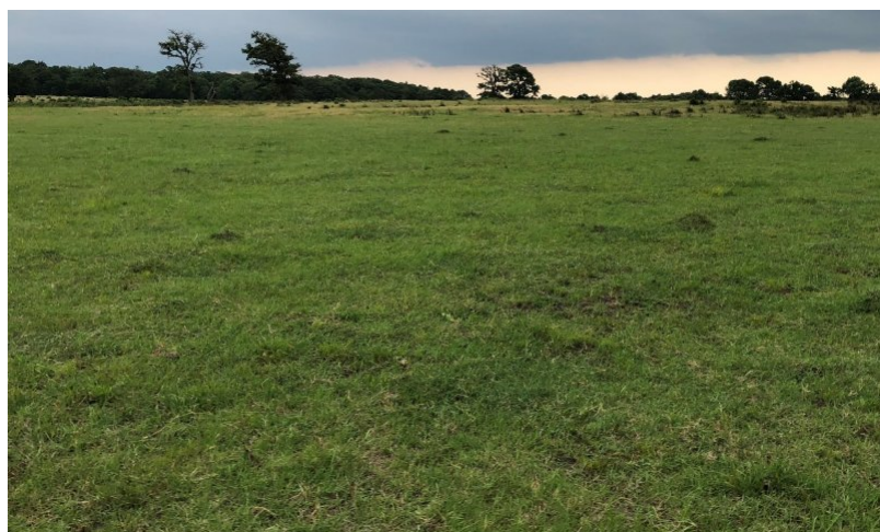
Figure 10. Agan soils. Johnston County, OK

This state represents a change in land use from rangeland to pastureland. The soil structure and biology has been altered and the site is dominated by introduced species. Management of introduced forages requires more inputs than native grasses. Careful consideration should be taken prior to planting to ensure the result meets the desired use. Ratings for forage yields can be found under the non-irrigated crop yield section in web soil survey. As with any fertility management program, current soil tests should be taken before planting and subsequent fertilization of introduced pastures. The most common forage species on these sites include Bermudagrass and Old World Bluestems(eg. KR Bluestem). Without brush management, woody species such as mesquites, junipers, elms, or honey locust may invade these sites. There may be opportunities to plant native grass species on these sites to restore the reference plant communities. The success of this type of restoration is highly variable and depends on the remaining soil resources and past management. This type of endeavor often requires site specific planning and evaluation. However, the species described in the reference state are a good resource for initial planning of any restoration project.