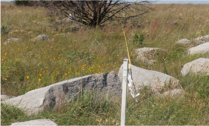
Figure 9. Kiti soils. Murray County, OK

The dominant grasses are big bluestem, Indiangrass, switchgrass, sideoats grama and little bluestem. Other grasses include dropseeds, silver bluestem, blue grama, hairy grama, texas wintergrass and Scribner’s panicum. Dominant forbs include sunflowers, goldenrods, black sampson, basketflower, gayfeathers, western ragweed, heath aster, poppymallows and. Legumes include Illinois bundleflower, sensitive-briar, scurfpea, and native lespedezas. Woody species include greenbriar, prairie rose, coralberry, hackberry and American elm. The Edgerock site is estimated to produce between 1,600– 3,000 pounds of vegetative production per year in reference condition. Midgrasses = Tallgrasses Forbs Minor component: Trees, Shrubs, Cool season grass/grasslike