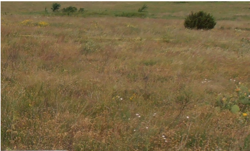
Figure 11. Kiti soils. Murray County, OK

This community has shifted to predominately midgrass and shortgrass species such as sideoats grama, Carolina joint-tail, dropseeds, blue grama, hairy grama and buffalograss with some remnant tallgrasses such as little bluestem remaining. Woody species canopy cover may increase due to lack of fire. Cool season grasses and sedges may increase as shade increases. Fine fuel loads have decrease and may limit effectiveness of prescribed fires making the community at risk of transitioning to a shrubland state.