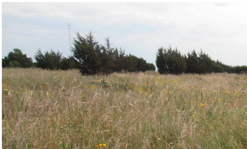
Figure 12. Kiti soils. Murray County, OK

This state is often the result of fire suppression for multiple years. Non fire-tolerant woody species such as elms, hackberry and juniper have increased and created a shaded environment with a heavy accumulation of leaf litter. Ecosystem processes are significantly altered and the herbaceous community is dominated by shade tolerant understory species. Greenbriar, grape and other shrubs and vines may create a dense understory layer.