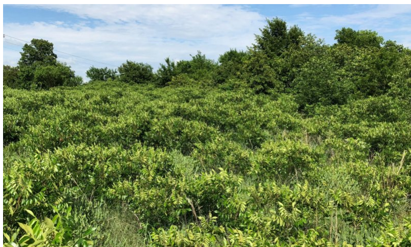
Figure 11. Durant soils. Murray County, OK

This state describes the invaded, woody dominated plant community of the Clay Upland site. The ecological processes are dominated by woody species including mesquite, honey locust, elm, and juniper species. Some herbaceous plants persist under the woody canopy or in interspaces. Usually, shade tolerant species like Texas wintergrass are prominent herbaceous components in this community. There may also be an increase in prickly pear in this state.