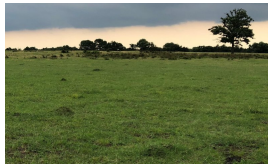
Converted Land Use

At this point it will take significant inputs to remove woody species and restore the grass dominated pasture. However, it may be achieved through brush management and a prescribed grazing plan which allows ample rest for the re-establishment of grasses.