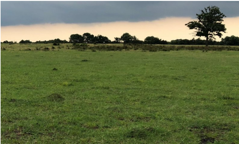
Figure 10. Ravia soils. Johnston County, OK

This state represents a change in land use from rangeland to pastureland. The soil structure and biology has been altered and the site is dominated by introduced species. Management of introduced forages requires more inputs than native grasses. Careful consideration should be taken prior to planting to ensure the result meets the desired use. Ratings for forage yields can be found under the non-irrigated crop yield section in web soil survey. As with any fertility management program, current soil tests should be taken before planting and subsequent fertilization of introduced pastures. The most common forage species on these sites include Bermudagrass and Old World Bluestems (eg. KR Bluestem). Without brush management, woody species such as mesquites, junipers, elms, or honey locust may invade these sites. There may be opportunities to plant native grass species on these sites to restore the reference plant communities. The success of this type of restoration is highly variable and depends on the remaining soil resources and past management. This type of endeavor often requires site specific planning and evaluation. However, the species described in the reference state are a good resource for initial planning of any restoration project.