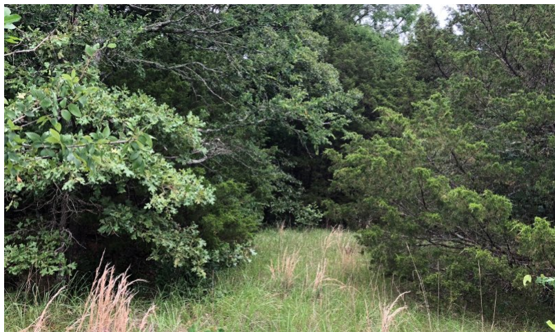
Figure 13. Chigley soils. Johnston County, OK

This state describes the invaded, woody dominated plant community of the Savannah site. The ecological processes are dominated by woody species including mesquite, honey locust, elm, hackberry and juniper species. Some herbaceous plants persist under the woody canopy or in interspaces. Usually, shade tolerant species like Texas wintergrass and sedges are prominent herbaceous components in this community.