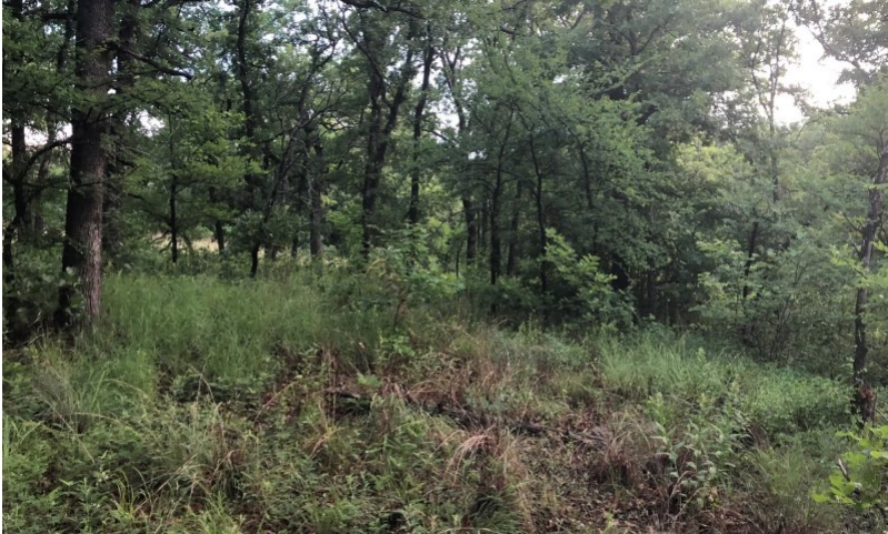
Figure 10. Chigley soils. Murray County, OK

This community has shifted to predominately midgrass species such as sideoats grama, dropseeds, purpletop and Carolina joint-tail with some remnant tallgrasses such as little bluestem remaining. Woody species canopy cover may increase due to lack of fire. Cool season grasses and sedges increase as shade increases. Heavy grazing has reduced palatable tallgrasses and forbs and the community is at risk of transitioning to a closed canopy state. Woody canopy averages between 40% - 60%.