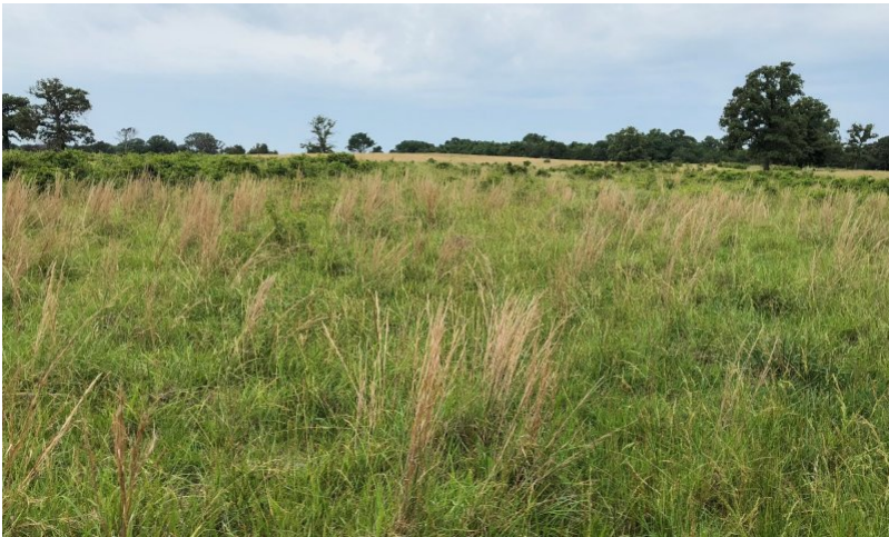
Figure 12. Chigley soils in fescue. Johnston County, OK

This state represents a change in land use from rangeland to pastureland. The soil structure and biology has been altered and the site is dominated by introduced species. Management of introduced forages requires more inputs than native grasses. Careful consideration should be taken prior to planting to ensure the result meets the desired use. Ratings for forage yields can be found under the non-irrigated crop yield section in web soil survey. As with any fertility management program, current soil tests should be taken before planting and subsequent fertilization of introduced pastures. The most common forage species on these sites include Bermudagrass and Old World Bluestems(eg. KR Bluestem). Without brush management, woody species such as mesquites, junipers, elms, or honey locust may invade these sites. There may be opportunities to plant native grass species on these sites to restore the reference plant communities. The success of this type of restoration is highly variable and depends on the remaining soil resources and past management. This type of endeavor often requires site specific planning and evaluation. However, the species described in the reference state are a good resource for initial planning of any restoration project.