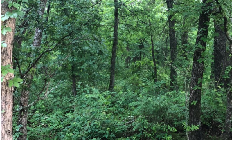
Figure 11. Naru soils. Murray County, OK

This state is often the result of fire suppression for multiple years. Non fire-tolerant woody species such as elms, hackberry and juniper have increased and created a shaded environment with a heavy accumulation of leaf litter. Ecosystem processes are significantly altered and the herbaceous community is dominated by shade tolerant understory species. Greenbriar, grape and other shrubs and vines may create a dense understory layer.