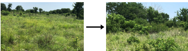
Grassland - Reference