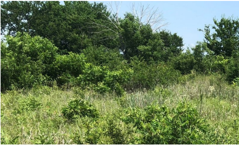
Figure 11. Rayford soils approaching state 4. Murray County, OK

This state describes the invaded, woody dominated plant community of the Clay Upland site. The ecological processes are dominated by woody species including mesquite, honey locust, elm, and juniper species. Some herbaceous plants persist under the woody canopy or in interspaces. Usually, shade tolerant species like Texas wintergrass are prominent herbaceous components in this community. There may also be an increase in prickly pear in this state.