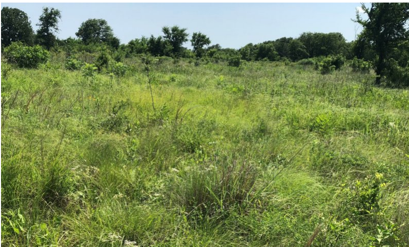
Figure 9. Rayford soils with brush encroaching. Murray County, OK

This is the reference state for the Shallow Upland ecological site. It represents the historic range of variability in the plant communities with the periodic disturbance of fire and grazing. It is dominated by herbaceous plants with few woody species. The dominant grasses are sideoats grama, big bluestem, Indiangrass, switchgrass and little bluestem. Other grasses include Texas cupgrass, dropseeds, silver bluestem, hairy grama, blue grama and Scribner's panicum. Dominant forbs include, western ragweed, heath aster, poppymallows and trailing ratany. Legumes include wild indigo, prairie clovers, scurfpea, and native lespedezas. Few woody species persist in reference condition but may include sumacs, sand plum, coralberry, persimmon and skunkbush. The Shallow Upland site is estimated to produce between 1,500 – 3,000 pounds of vegetative production per year in reference