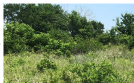
Grassland - Reference