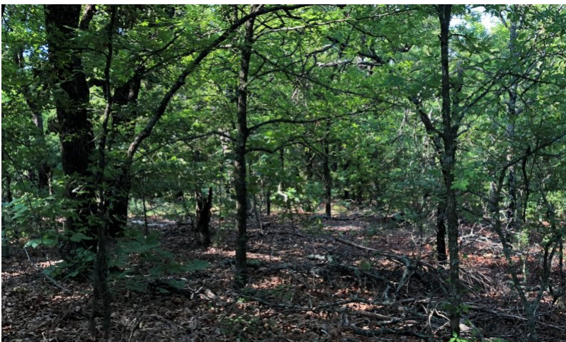
Figure 8. Travertine soils, Murray County, OK

This state is often the result of fire suppression for multiple years. Non fire-tolerant woody species such as elms, hackberry and juniper have increased and created a shaded environment with a heavy accumulation of leaf litter. Ecosystem processes are significantly altered and the herbaceous community is dominated by shade tolerant understory species. Greenbriar, grape and other shrubs and vines may create a dense understory layer.