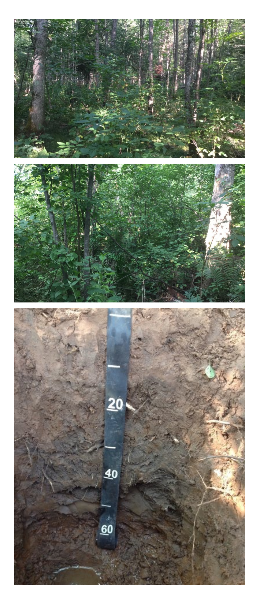
In the absence of frequent long duration flooding a wet forest community composed of Black ash and Balsam fir will dominate these sites. Common associates may include Red maple, American elm, and White cedar. White cedar is