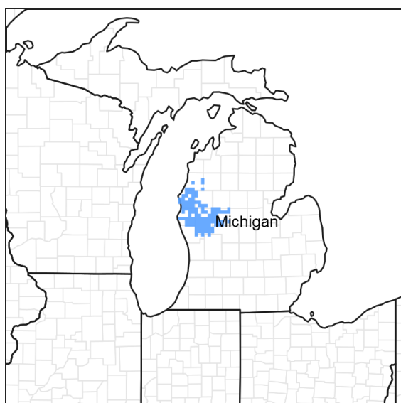
Figure 1. Mapped extent

Provisional. A provisional ecological site description has undergone quality control and quality assurance review. It contains a working state and transition model and enough information to identify the ecological site.