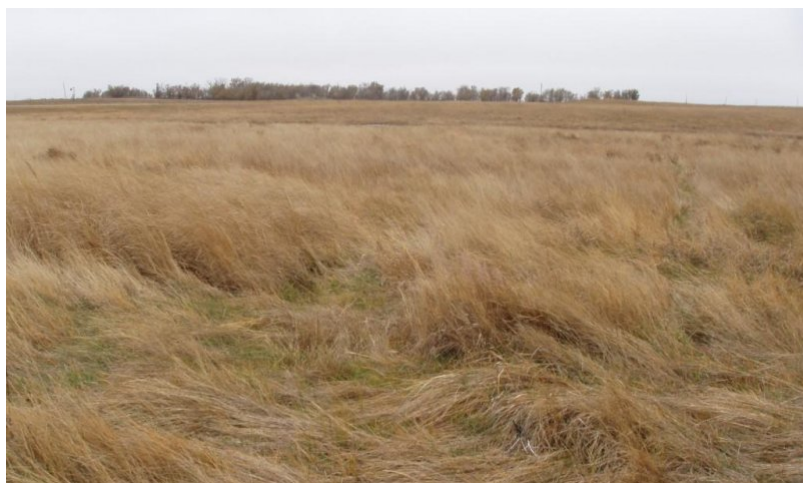
Figure 11. Typical Reference Community vegetation found on the Saline lowland site.

Interpretations are based primarily on the 1.1 Prairie Cordgrass-Alkali Cordgrass-Nuttall's Alkaligrass Plant Community Phase. This community evolved with grazing by large herbivores, occasional prairie fires, and periodic flooding events, and can be found on areas that are properly managed with grazing and/or prescribed burning. The potential vegetation is about 85 percent grasses and grass-like plants and 15 percent forbs. The major grasses include prairie and alkali cordgrass, and Nuttall's alkaligrass. Other grass and grass-like species present include western wheatgrass, slender wheatgrass, inland saltgrass, switchgrass ( Panicum virgatum ), sedge ( Carex ), and foxtail barley. Salt tolerant forbs such as alkali plantain ( Plantago eripoda ), western dock ( Rumex aquaticus ), and Pursh seepweed ( Suaeda calceoliformis ) are common. Interpretations are based primarily on this plant community phase. This community phase is diverse, stable, productive, and well adapted to both saline soils and the Northern Great Plains climatic conditions. Community dynamics, the nutrient and water cycles, and energy flow are functioning properly. Litter is properly distributed with very little movement offsite and natural plant mortality is very low. This community is resistant to many disturbances except continuous grazing, tillage, or development into urban or other uses. The diversity in plant species allows for both the fluctuation of flooding and large variations in climate.