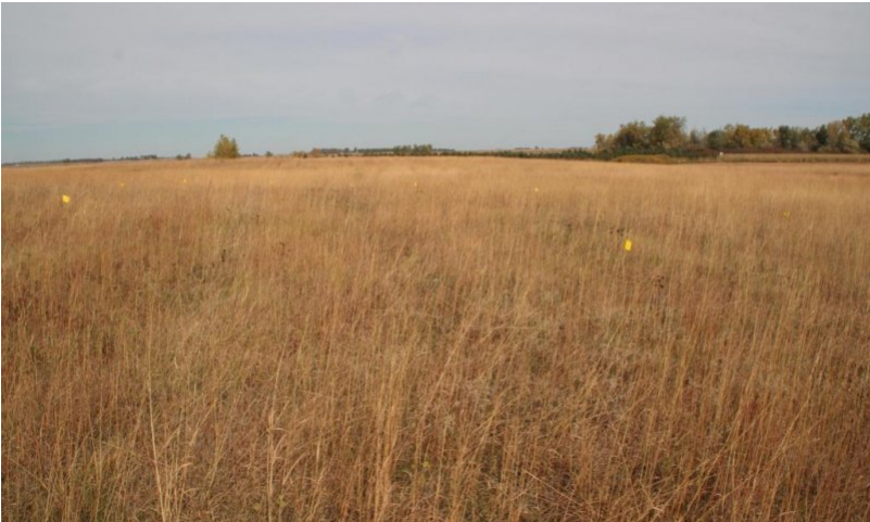
Figure 12. Vegetation typical of the Reference Community on the Loamy site in MLRA 102B.

The Reference State represents the natural range of variability that dominated the dynamics of this ecological site (ES). This state was dominated by warm-season grasses, with cool-season grasses being subdominant. Prior to European settlement in North America, the primary disturbance mechanisms for this site in the Reference condition included periods of below and above average precipitation, periodic fire, and herbivory by insects and large ungulates. The timing of fires and herbivory coupled with weather events dictated the dynamics that occurred within the natural range of variability. In some locations, this site likely received relatively heavy grazing pressure. Tall warm-season grasses would have declined and cool-season bunchgrasses and short to mid-statured warm-season grasses would have increased. Today, a similar state, the Native/Invaded State (State 3) can be found on areas that are properly managed with grazing and/or prescribed burning, and sometimes on areas receiving occasional short periods of rest.