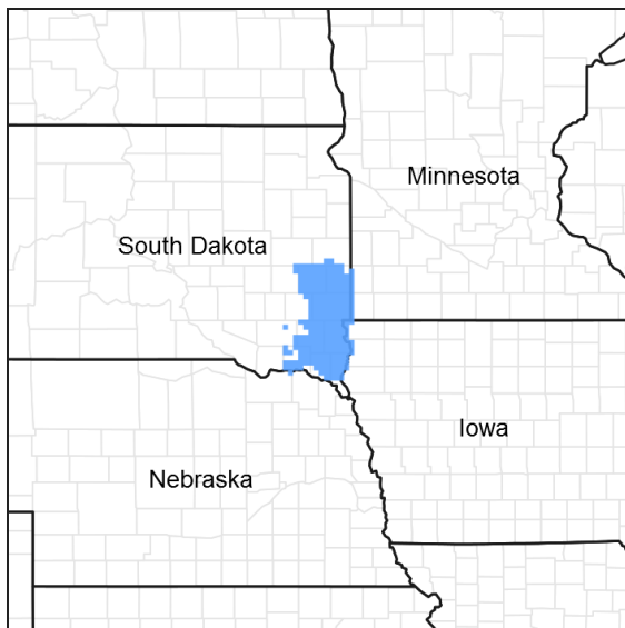
Figure 1. Mapped extent

Provisional. A provisional ecological site description has undergone quality control and quality assurance review. It contains a working state and transition model and enough information to identify the ecological site.