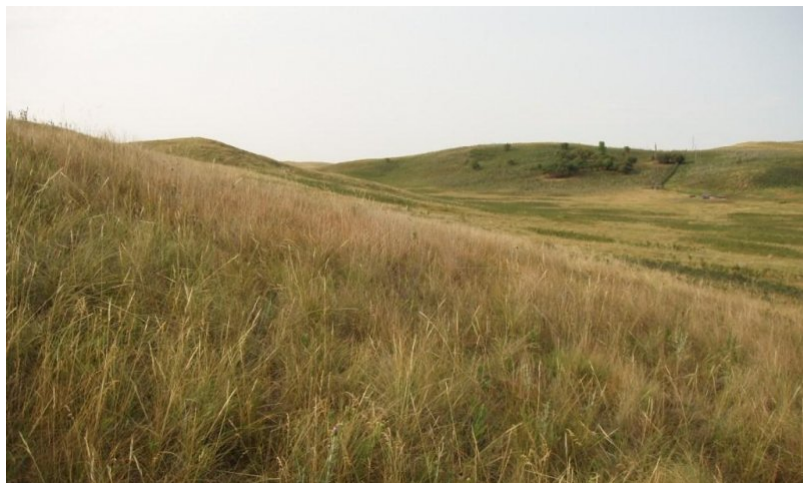
Figure 12. Typical vegetation associated with the Reference Community of the Thin Upland site in MLRA 102B.

Interpretations are based primarily on the 1.1 Little Bluestem-Porcupinegrass-Prairie Dropseed Plant Community Phase . The potential vegetation was about 80 percent grasses or grass-like plants, 10 percent forbs, and eight percent shrubs. The community was dominated by warm-season grasses, with cool-season grasses being subdominant. The major grasses included little bluestem, porcupinegrass, prairie dropseed, big bluestem, Indiangrass, sideoats grama, and green needlegrass. Other grass or grass-like species included plains muhly ( Muhlenbergia cuspidata ), switchgrass ( Panicum virgatum ), Canada wildrye ( Elymus Canadensis ), needleandthread ( Hesperostipa comata ), slender wheatgrass ( Elymus trachycaulus ), western wheatgrass, blue grama, and threadleaf sedge ( Carex filifolia ). This plant community was resilient and well adapted to the Northern Great Plains climatic conditions. The diversity in plant species allowed for high tolerance to drought. This was a sustainable plant community in regards to site and soil stability, watershed function, and biologic integrity.