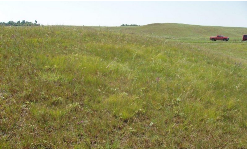
Figure 11. Typical vegetation associated with the Reference Community of the Very Shallow site in MLRA 102B.

The Reference State represents the natural range of variability that dominates the dynamics of this ecological site (ES). This state is dominated by cool-season grasses with warm-season grasses being subdominant. Prior to European settlement of North America, the primary disturbance mechanisms for this site in the Reference condition were grazing by large herding ungulates and fluctuations in levels of precipitation. Grazing, coupled with weather events, dictated the dynamics that occurred within the natural range of variability. Today this state can be found on areas that are properly managed with grazing and/or prescribed burning and sometimes on areas receiving occasional short periods of rest. The dominant tall and mid-grass species can decline and a corresponding increase in short-statured species will occur.