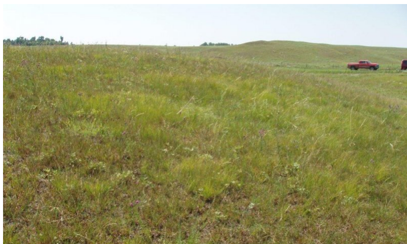
Figure 11. Typical vegetation associated with the Reference Community of the Very Shallow site in MLRA 102B.