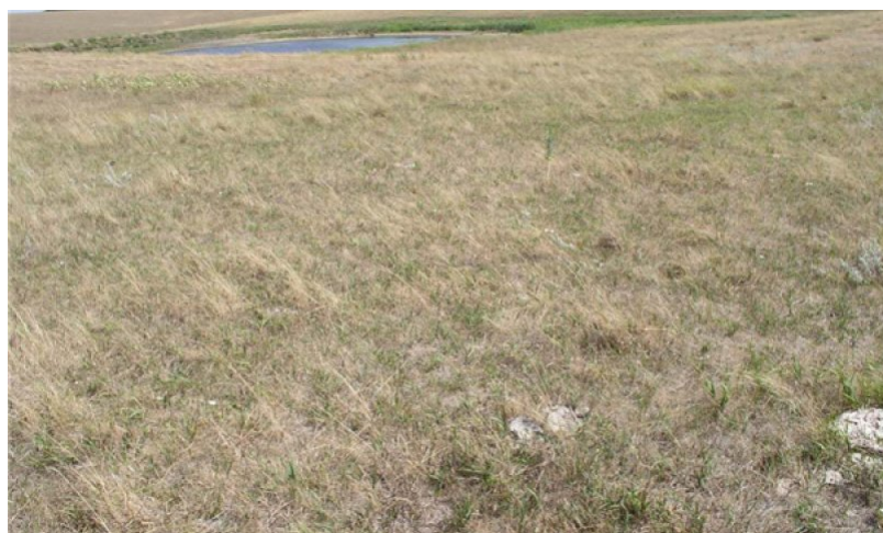
Figure 11. LyL 2.1 - native/brome mix in drought

While native grasses still dominate the site, introduced cool-season species have established a foothold in the