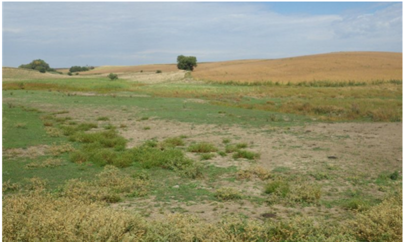
Figure 16. LyL 4.1 - feeding area

Nutrient cycling, hydrologic function, and/or soil stability have been severely altered, and possibly compromised. This is a highly variable state in which the specific plants observed will depend largely on the original community and the nature of the disturbance. This condition encompasses (but is not necessarily limited to) events such as severe fire impacts, heavy continuous grazing, heavy nutrient inputs, and abandoned cropland.