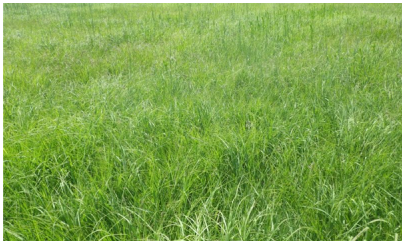
Figure 7. Loamy Lowland 1.1 - mid-July

This is the interpretive plant community and can be found on areas that are properly managed with prescribed grazing that allows for adequate recovery periods following each grazing event. The plant community consists of 85-95% grasses and grass-like, 5-10% forbs and 0-5% shrubs. Dominant grasses include big bluestem, little bluestem, indiagrass, and switchgrass. Other grasses and grass-like are sideoats grama, Scribner's panicum, and sedges. Forb species are diverse and include cudweed sagewort, western ragweed, and goldenrods. Common shrubs include western snowberry and leadplant. This plant community is diverse, stable, and productive. Plant community dynamics, nutrient cycles, water cycles, and energy flow are functioning properly. Plant litter is properly distributed with negligible movement off-site and natural plant mortality is very low. This community is resistant to many disturbances except continuous, season-long heavy grazing, tillage, or non-use. Broadcast herbicide application will dramatically reduce forb diversity and abundance. Total annual production, during an average year, ranges from 3,200 to 4,800 pounds per acre air-dry weight and will average 4,000 pounds.