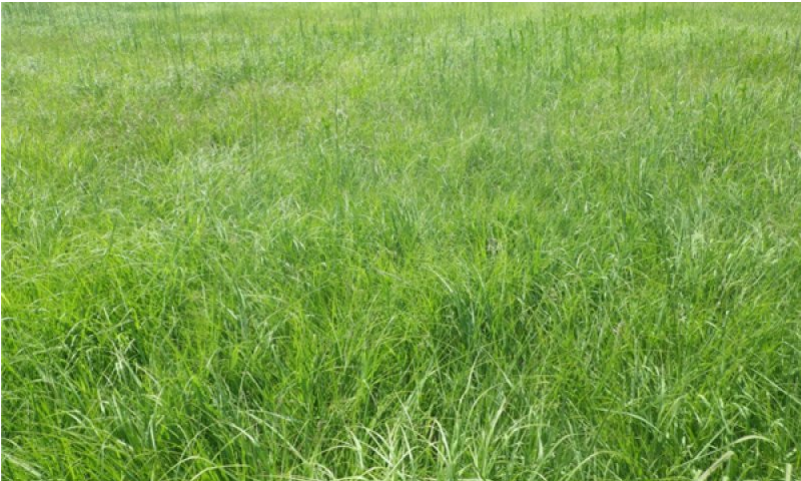
Figure 7. Loamy Lowland 1.1 - mid-July

This is the interpretive plant community and can be found on areas that are properly managed with prescribed grazing that allows for adequate recovery periods following each grazing event. The plant community consists of 85-95% grasses and grass-like, 5-10% forbs and 0-5% shrubs. Dominant grasses include big bluestem, little bluestem, indiangrass, and switchgrass. Other grasses and grass-like are sideoats grama, Scribner's panicum, and sedges. Forb species are diverse and include cudweed sage, western ragweed, and goldenrods. Common shrubs include western snowberry and leadplant. This plant community is diverse, stable, and productive. Plant community dynamics, nutrient cycles, water cycles, and energy flow are functioning properly. Plant litter is properly distributed with negligible movement off-site and natural plant mortality is very low. This community is resistant to many disturbances except continuous, season-long heavy grazing, tillage, or non-use. Broadcast herbicide application will dramatically reduce forb diversity and abundance. Total annual production, during an average year, ranges from 3,200 to 4,800 pounds per acre air-dry weight and will average 4,000 pounds.