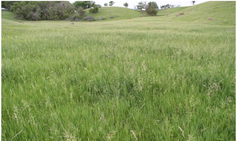
Figure 14. LyL 3.1 - brome

This community is typically composed of smooth brome with bluegrass interspersed among the brome tillers. Warm-season natives, if present, are sparse yet often conspicuous due to pronounced differences in growth habits and metabolic pathways. Community structure and function have been dramatically simplified relative to the reference condition, and very few biotic functional groups are represented in amounts that would influence ecological function. The invasive grass root skein provides good site stability; however, replacement of the deeper roots and complex bunchgrass canopy with the shallower roots and erect tiller canopy of the invaders results in reduced interception and infiltration rates.