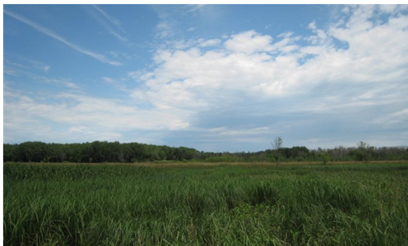
Figure 8. Poned Floodplain Prairie at Pershing State Park, Linn County, Missouri

This phase is dominated by a dense cover of wetland species, including prairie cord grass, sedges and wet tolerant forbs. Shrubs, such as buttonbush and willow, are scattered throughout. The lowest and wettest areas may have marshes with cattails, river bulrush and other emergent wetland species, and minor areas of open water