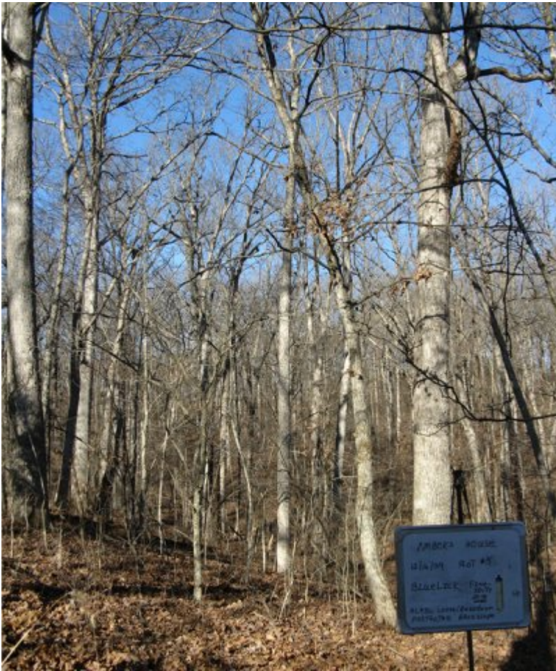
Figure 9. A Loamy Protected Backslope Forest on private land in Boone County, Missouri

This is an even-aged forest management phase. Logging activities are removing higher volumes of white oak causing a decrease in white oak in the canopy and an increase in northern red oak. Large group, shelterwood or clearcut harvests create a more uniform age class structure throughout the canopy layer while also opening up the understory and allowing more sunlight to reach the forest floor.