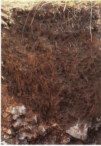
Figure 7. Bluelick series