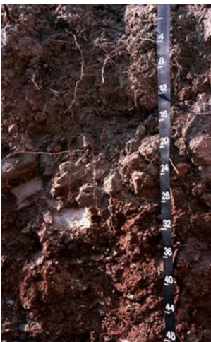
Figure 7. Goss series

The accompanying picture of the Goss series shows a thin, light-colored surface horizon underlain by very cobbly reddish clay. Scale is in inches.