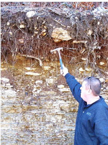
Figure 7. Gatewood series

The accompanying picture of the Gatewood series shows abundant chert fragments in the upper part of the soil, over a reddish clay subsoil. Cherty limestone/dolomite bedrock limits rooting depth.