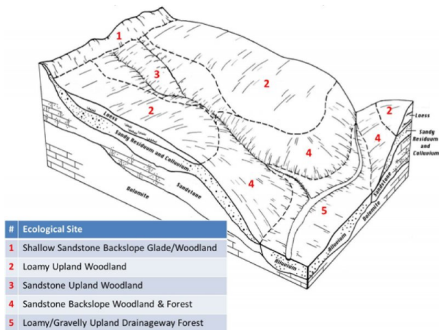
Figure 2. Landscape relationships for this ecological site.