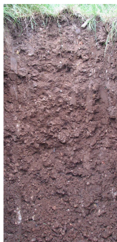
Figure 7. Cedargap series

The accompanying picture of the Cedargap series shows the abundant gravel and cobble content that characterizes these skeletal soils. Scale is in feet.