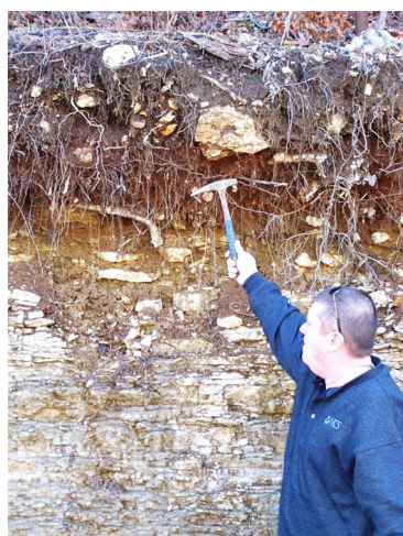
Figure 7. Gatewood series

The accompanying picture of the Gatewood series shows abundant chert fragments in the upper part of the soil, over a reddish clay subsoil. Cherty limestone/dolomite bedrock limits rooting depth.