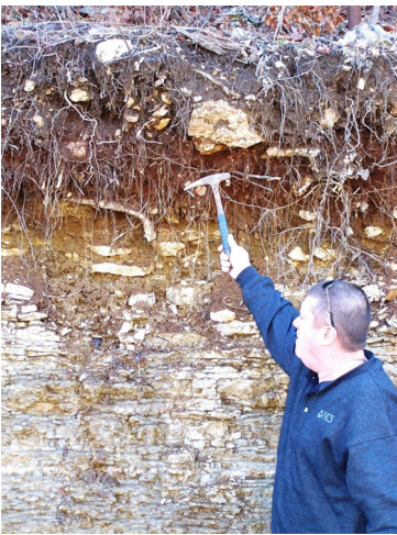
Figure 7. Gatewood series

The accompanying picture of the Gatewood series shows abundant chert fragments in the upper part of the soil, over a reddish clay subsoil. Cherty limestone/dolomite bedrock limits rooting depth.