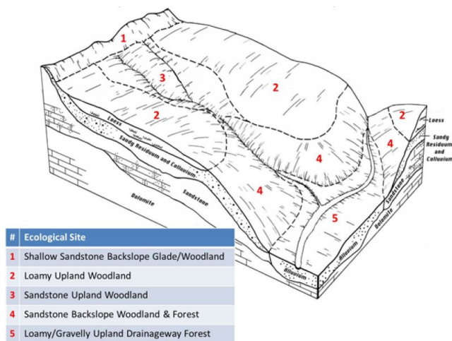
Figure 2. Landscape relationships for this ecological site.