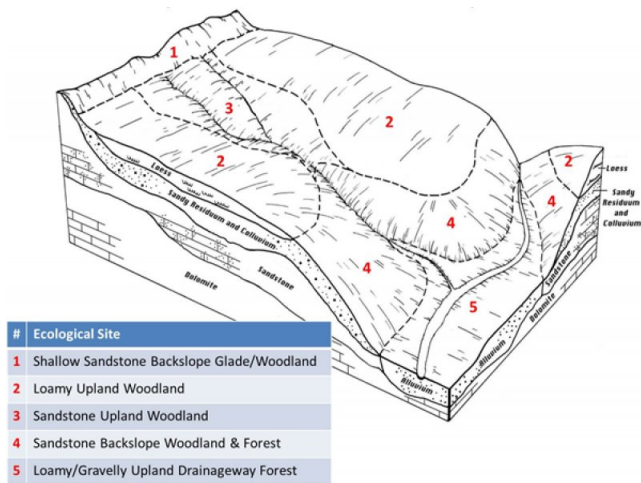
Figure 2. Landscape relationships for this ecological site.