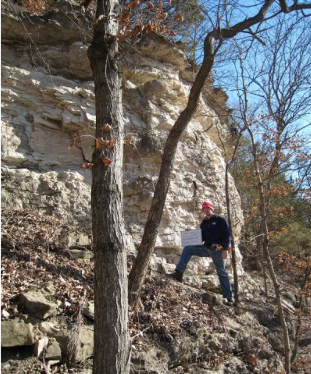
Figure 11. Exposed cliff in Boone County, Missouri

Eastern Redcedar – Chinkapin Oak/American Bittersweet /Sideoats Grama – Purple Cliffbrake Fern