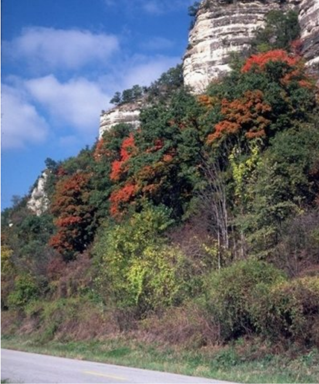
Figure 10. Exposed dolomite cliff near Bluffton, Missouri.

The reference plant community is characterized by rock shelves, vertical rock cliffs and by stress tolerant trees, shrubs, ferns, lichens and mosses. These sites have large expanses of bare rock, with a variety of plants occupying cracks and minor ledges across the cliff face. When present, trees are stunted and the herbaceous vegetation is generally sparse.