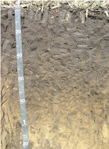
Figure 9. DeSioux series