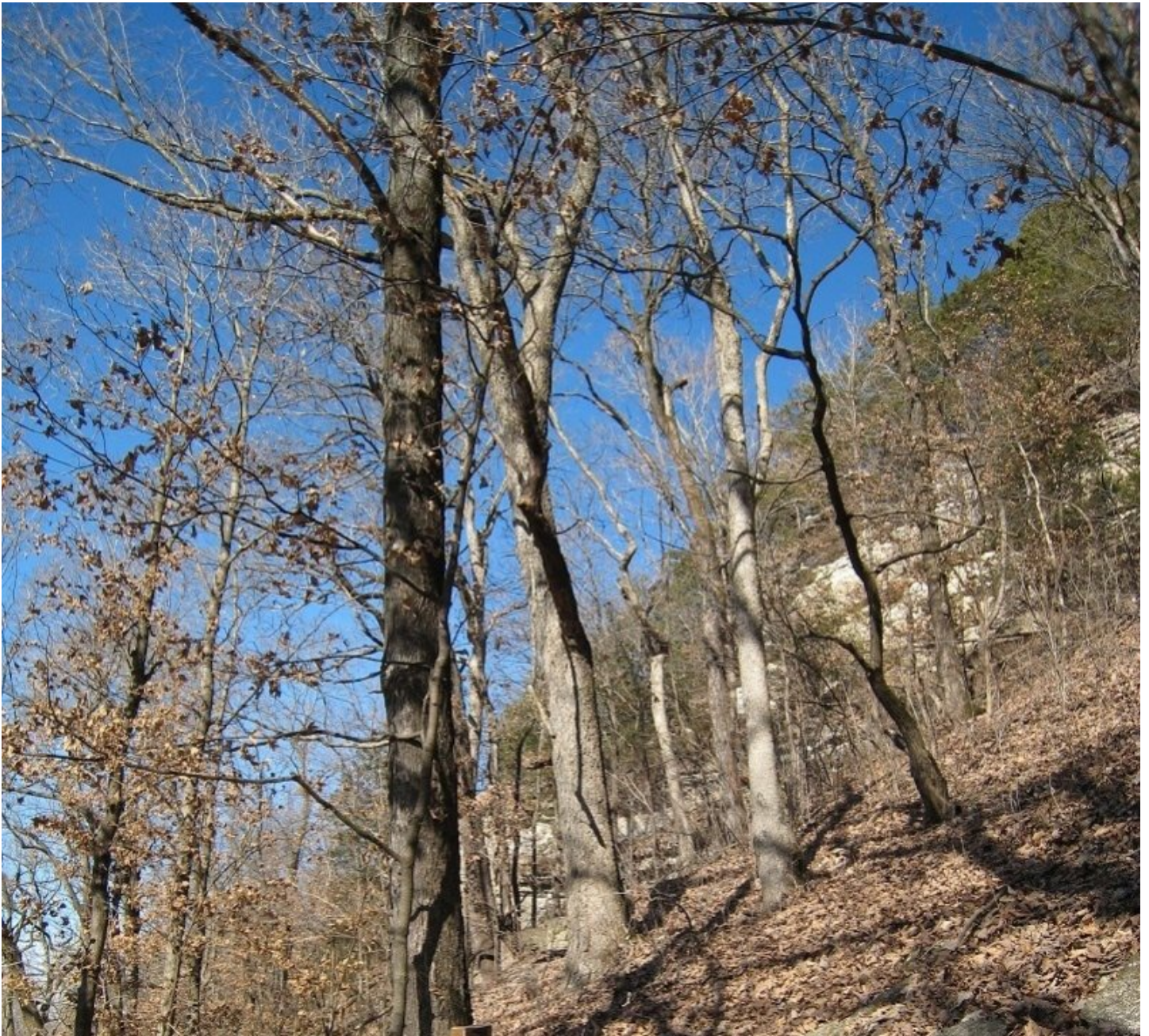
Figure 10. Reference talus ecological site in Missouri; photo credit MDC.