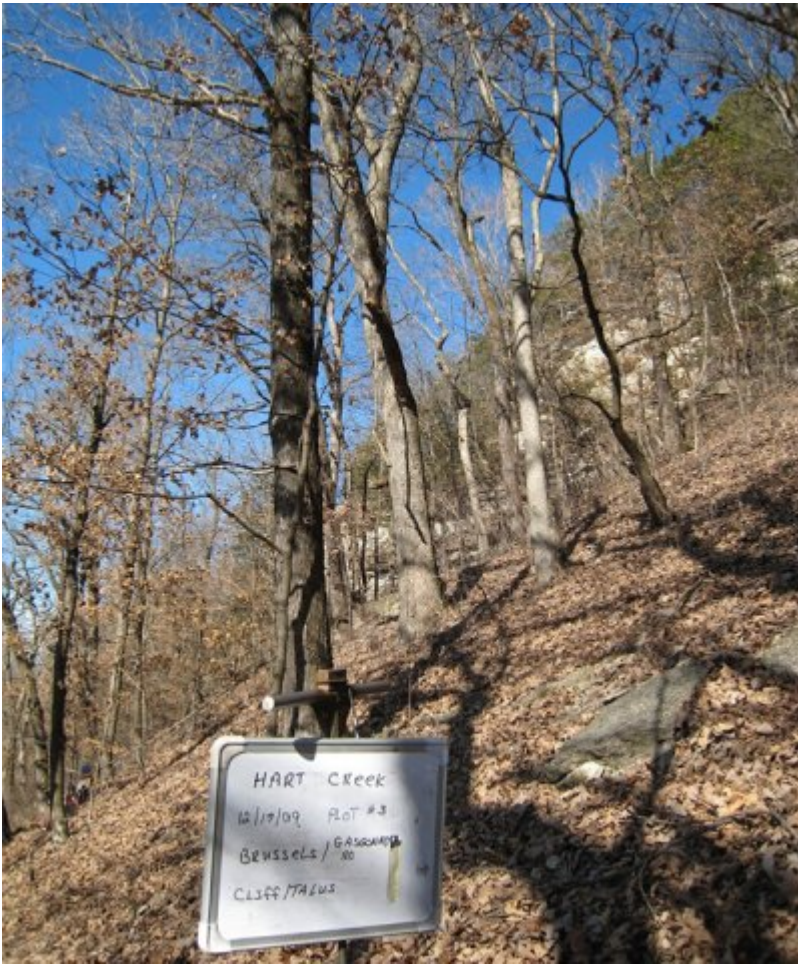
Figure 11. Talus and cliff ecological reference sites at Hart Creek Conservation Area, Missouri

Forest overstory. Forest Overstory Species list is based on field reconnaissance as well as commonly occurring species listed in Nelson 2010; names and symbols are from USDA PLANTS database.