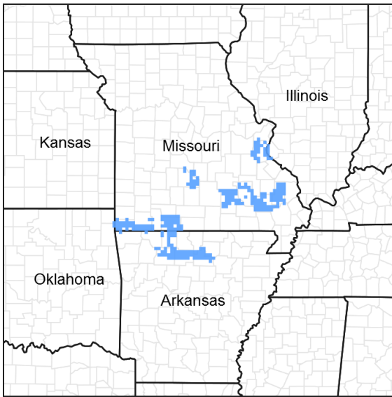
Figure 1. Mapped extent

Provisional. A provisional ecological site description has undergone quality control and quality assurance review. It contains a working state and transition model and enough information to identify the ecological site.