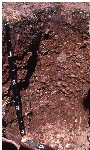
Figure 9. Waben series

The accompanying picture of the Waben series shows the abundant gravel and cobble content that characterizes these skeletal soils. Scale is in feet.