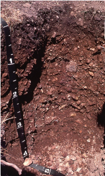
Figure 9. Waben series