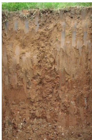
Figure 9. Pomme series

The accompanying picture of the Pomme series shows a thin, light-colored silt loam surface horizon over a brown clay loam subsoil. Red very gravelly clay is typically in the lower part of the soil profile, and appears in the lower horizons of this picture.