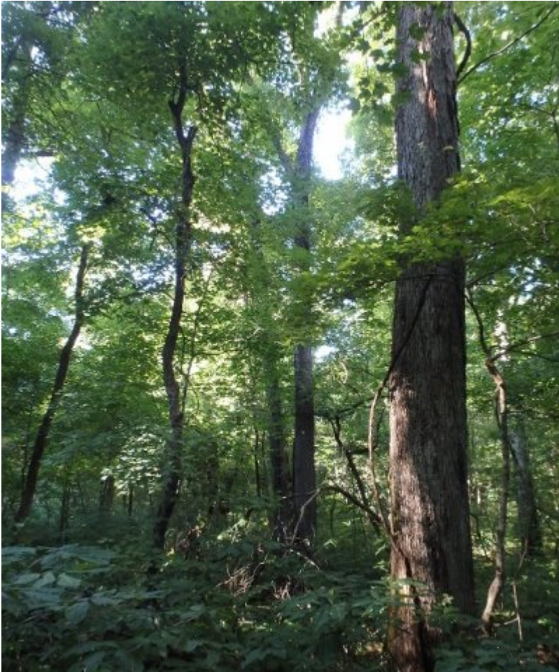
Figure 11. Reference state along Current River, Ozark National Scenic Riverways, Missouri; photo credit MDC.

Two community phases are recognized in this state, with shifts between phases based on disturbance frequency.