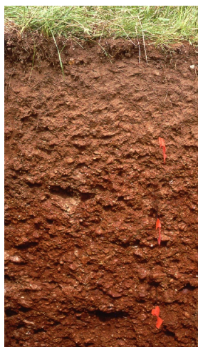
Figure 9. Britwater series

The accompanying picture of the Britwater series shows a thin, light-colored gravelly silt loam surface horizon over a reddish gravelly silty clay loam subsoil. Coarse fragment content increases with depth in this soil.