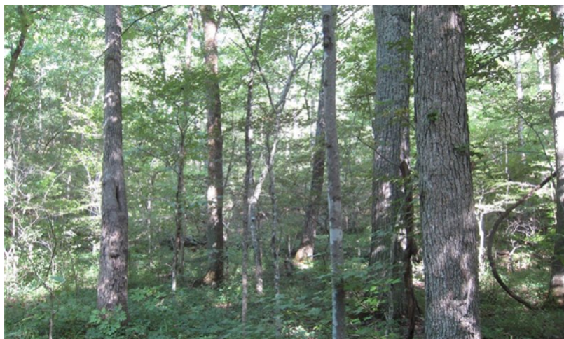
Figure 11. Gravelly/Loamy Upland Drainageway Forest at Cave Fork Creek, Mark Twain National Forest. Carter Co., Missouri; photo credit MDC.

Two community phases are recognized in the reference state, with shifts between phases based on disturbance frequency.