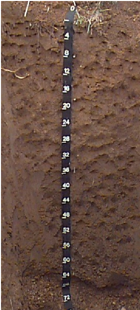
Figure 9. Gladden series