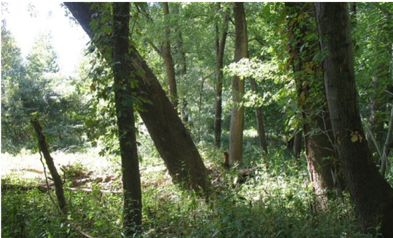
Figure 11. Reference phase at Shaw Nature Reserve, Franklin County, MO.

This phase is dominated by mature sycamore and eastern cottonwood. While these species can occur together, sycamores tend to dominate the smaller, higher energy streams with more gravel, while eastern cottonwood is more dominant on larger rivers with less gravel.