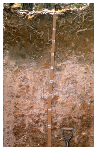
Figure 9. Plato series

The accompanying picture of the Plato series shows a thin, light-colored surface horizon and reddish brown gravelly silt loam subsoil, over a fragipan at about 60 cm. The fragipan is a barrier to roots. Redoximorphic features in the subsoil above the fragipan are an indication of seasonal wetness. Scale is in centimeters.