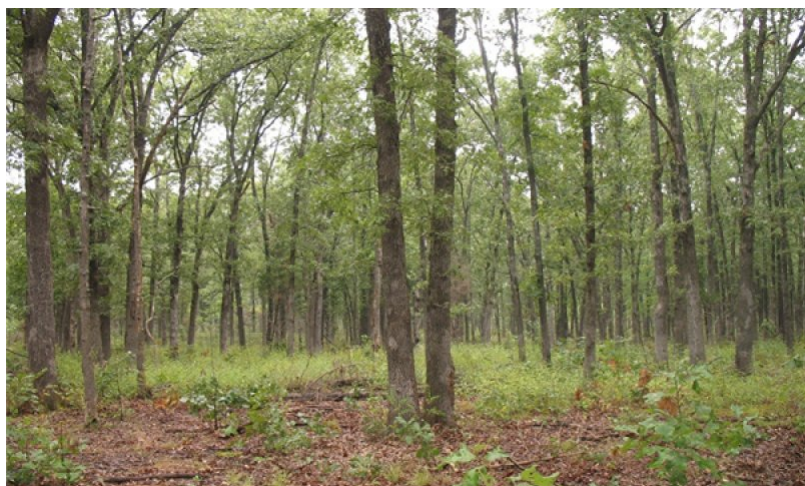
Figure 11. Reference state at Western Star Flatwoods Natural Area, Phelps County, Missouri; photo credit MDC.