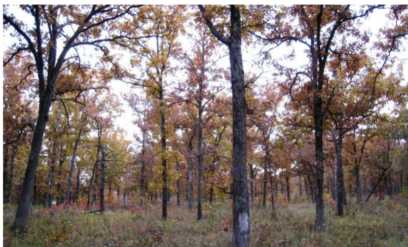
Figure 12. Reference state at St. Francois State Park, St. Francois County, Missouri; photo credit MDC.

Two community phases are recognized in this state, with shifts between phases based on disturbance frequency.