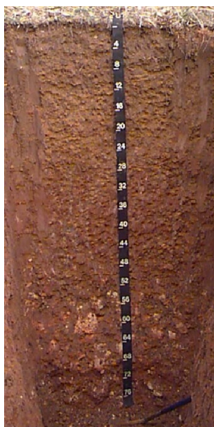
Figure 9. Paintbrush series

The accompanying picture of the Paintbrush series shows a dark silt loam surface horizon over a brown silty clay loam subsoil, underlain by very gravelly clay.