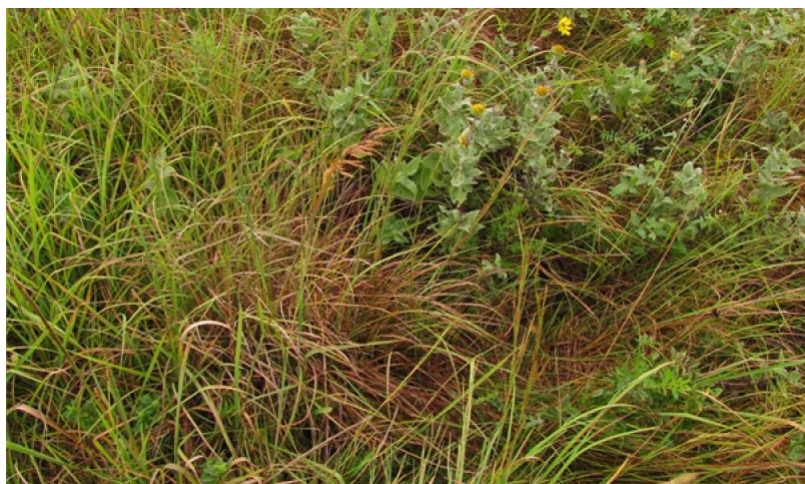
Figure 11. Reference state at Hite Prairie Conservation Area, Morgan County, Missouri; photo credit MDC.

Two phases can occur that will transition back and forth depending on fire frequencies. Longer fire free intervals will allow woody species to increase such as gray dogwood and oak saplings. When fire intervals shorten these woody species will decrease.