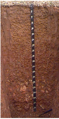
Figure 9. Paintbrush series