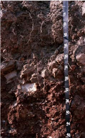
Figure 9. Goss series

These soils have no rooting restriction, and subsoils are not low in bases. The soils were formed under woodland vegetation, and have thin, light-colored surface horizons. Parent material is slope alluvium over residuum weathered primarily from limestone. They have very gravelly or very cobbly silt loam surface horizons, and skeletal subsoils with high amounts of chert gravel and cobbles. They are not affected by seasonal wetness. Soil series associated with this site include Goss and Rueter. The accompanying picture of the Goss series shows a thin, light-colored surface horizon underlain by very cobbly reddish clay. Scale is in inches.