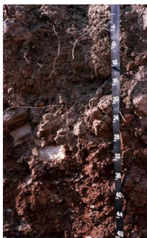
Figure 9. Goss series

The accompanying picture of the Goss series shows a thin, light-colored surface horizon underlain by very cobbly reddish clay. Scale is in inches. Picture from Henderson (2004).