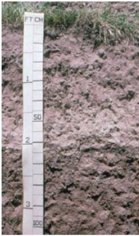
Figure 9. McCune series