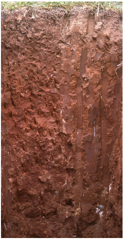
Figure 9. Newtonia series