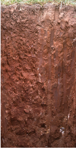
Figure 9. Newtonia series