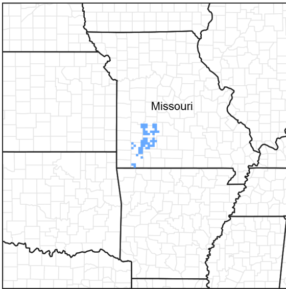
Figure 1. Mapped extent

Provisional. A provisional ecological site description has undergone quality control and quality assurance review. It contains a working state and transition model and enough information to identify the ecological site.